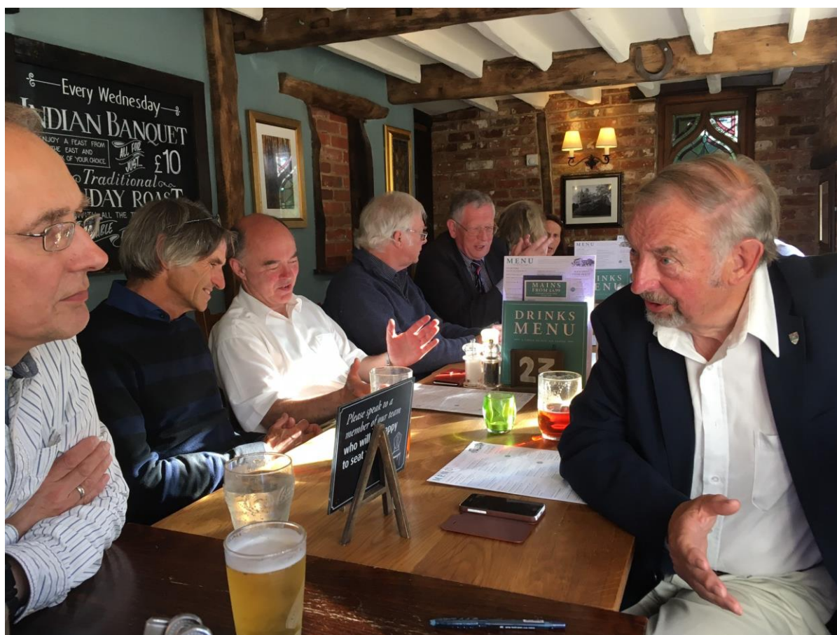
Another photo from the Royal Oak at Pirbright featured on the front cover of this issue of the News Sheet