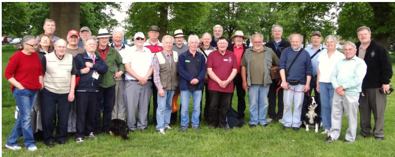
Dunstable Downs Radio Rally (aka Luton car boot sale). A busy rally was once again had by all who attended this Luton Rally.