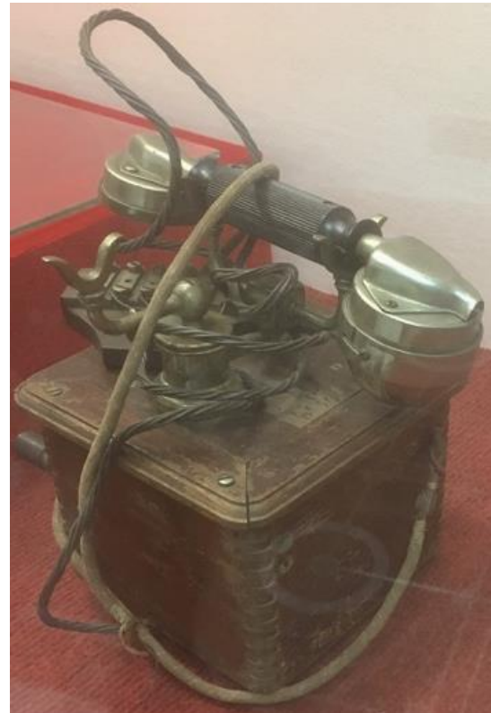
Ancient-looking field telephone of unknown origin