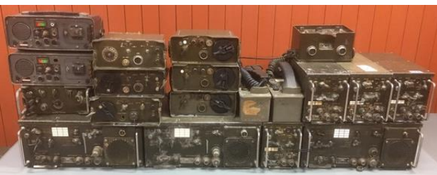
RT-524 and R-442 VHF FM radios