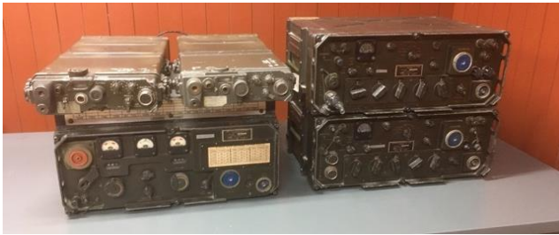
GRC-106 and PRC-10 Transmitter and receiver

I visited this place in March 2017 during a backpacking holiday of Laos and Vietnam. The palace in Saigon, as it was then, was eventually captured by the North Vietnamese troops after the Americans had withdrawn. Vietnam became one Socialist state, so the country was indeed re-unified. The most interesting part to me was the underground bunker, which contained a great deal of American-made communications equipment, installed when South Vietnam was being militarily assisted by the US. I apologise that most of the shots are "long", but the area was roped off.