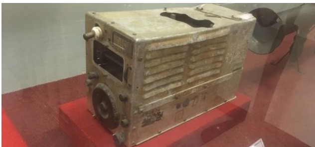
SCR-274N 'Command-Set' transmitter