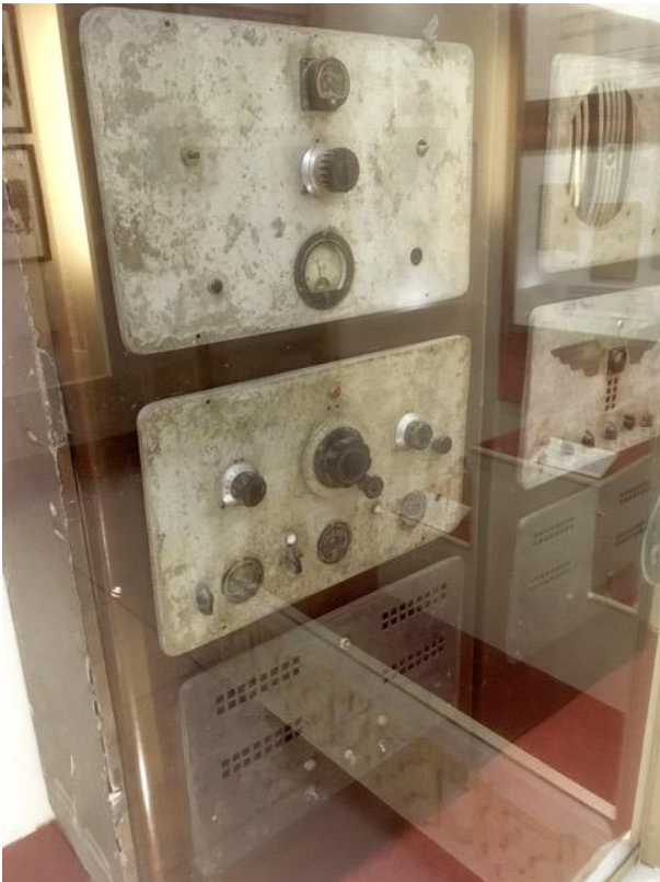
A broadcast transmitter used as the Voice of South Vietnam