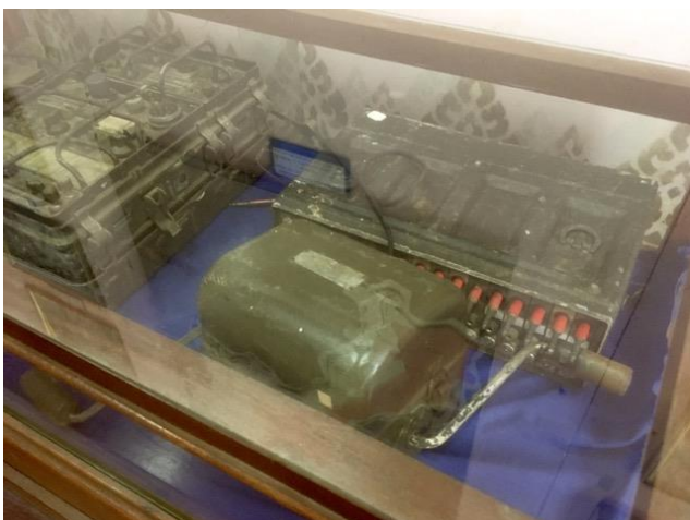
GRC-9 HF transmitter/receiver (upside down, sadly)

Sadly, there was little coverage of radio equipment, but I managed to photograph the following, displayed in a glass case. I apologise for the annoying reflections present.