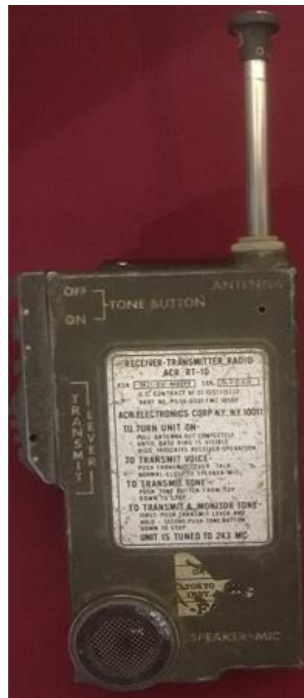
A UHF transceiver for downed pilots to summon help