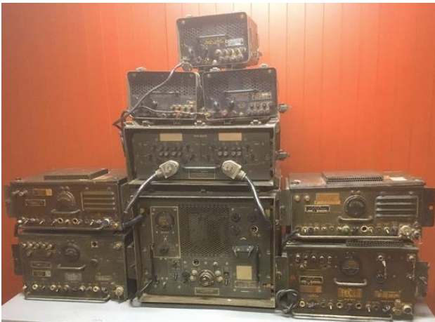
TRC-1 VHF link