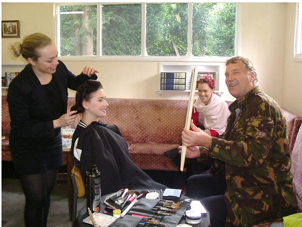
Those who watched "Code-Breakers" on BBC TV on 25 th November will recognise two of the ladies as actresses; filming took place around the Bletchley Park Event in September. Our Chairman somehow got in on the 'act' in the dressing room! More pictures inside.