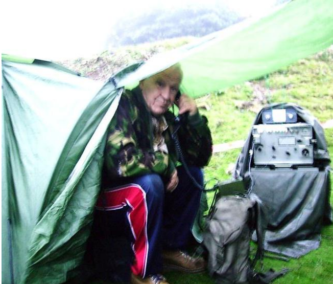
Me under cover in action on the Friday Evening Net

morning. I made good contact on the AM Net, but I realised that I would have to pack up, take the tent etc., home as the weather was coming in very wet and horrible. Reluctantly, I drew stumps and left the field.