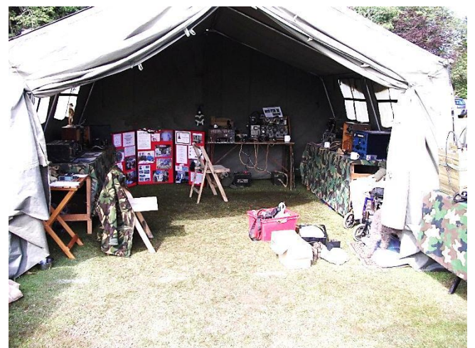
Interior of tent

As soon as that was ready, I had to work on drying out my sleeping kit as I was leaving for Europe on the Monday