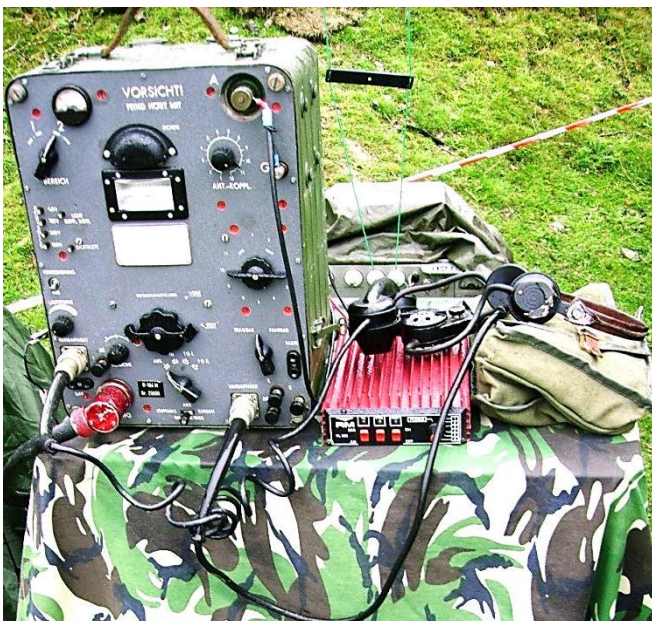
R104 and linear ready for the Saturday Morning Net