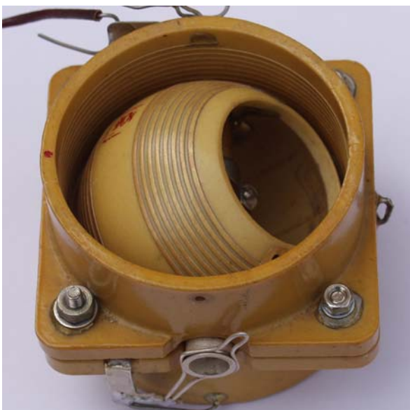
The variometer referred to below