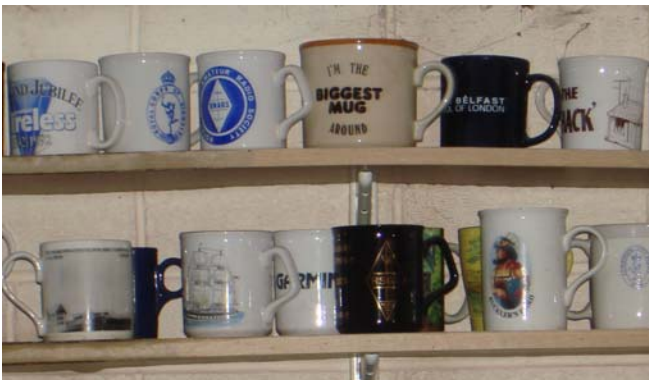
A small selection of mugs from George's collection

Very much to Anne's delight, George had also an impressive collection of ceramic mugs, all related to radio in some form or other!