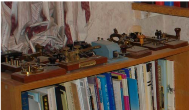
Some of George's Morse keys. It is difficult to show a picture which does justice to this collection!

Very much to Anne's delight, George had also an impressive collection of ceramic mugs, all related to radio in some form or other!