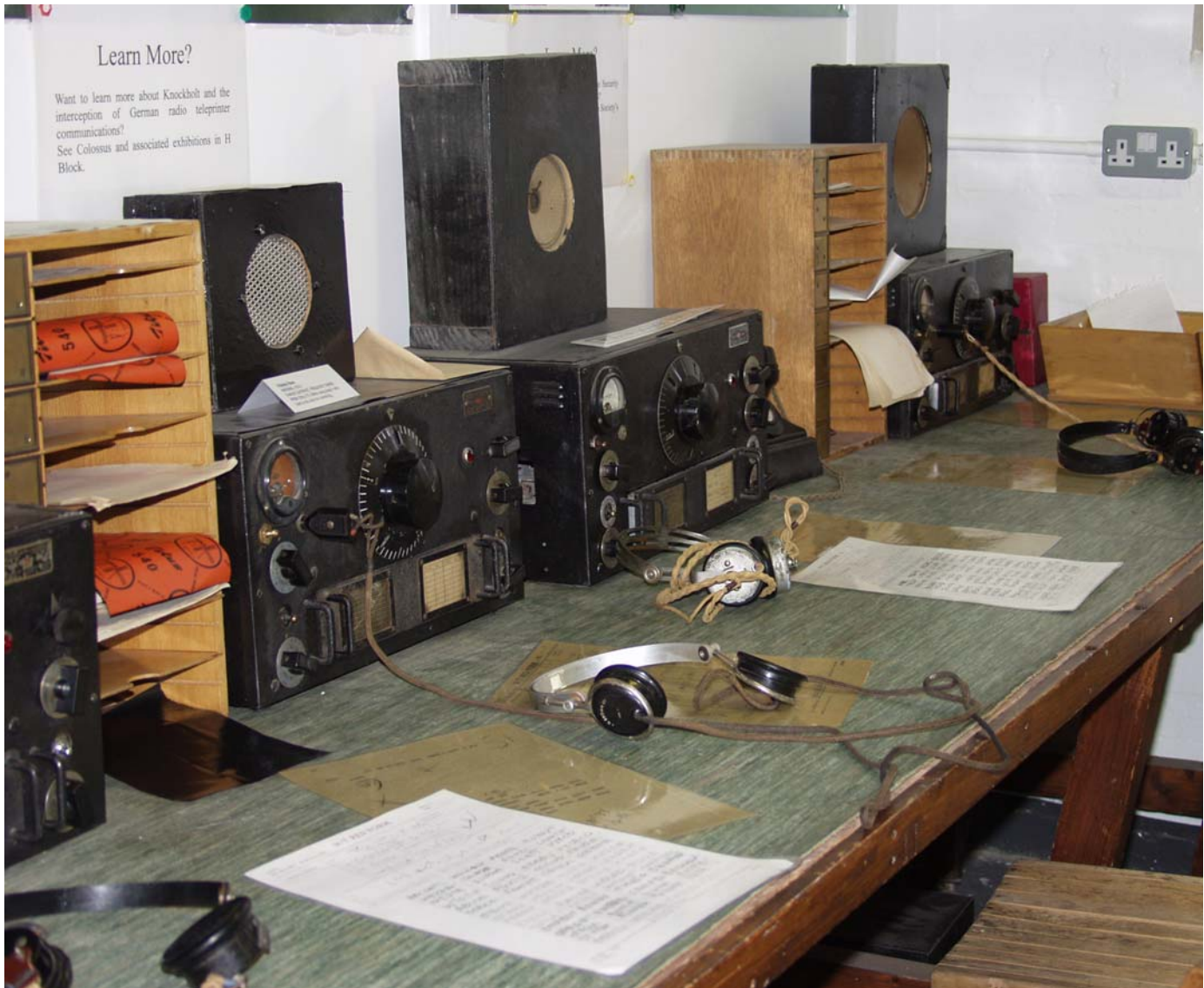
Replica Y-Station set up at Bletchley Park

Mike Hahn G4JRB 01708 520564 weekends and evenings only.