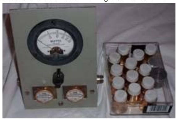
Bird Termaline VHF wattmeter model 6104, 25MHz to 512MHz. In working order. No instructions. £40

Bird Dual-socket Thruline wattmeter Model 4522 with 2 heads fitted and a selection of six others (not as photograph), covering 25-600MHz. The unit has clearly been removed from a rack-mounting assembly, and has front and base panels only. N-type connectors. Generic instructions available. Good working order. £200 o.n.o.